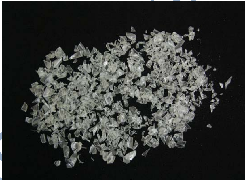
CLEAN PET FLAKES