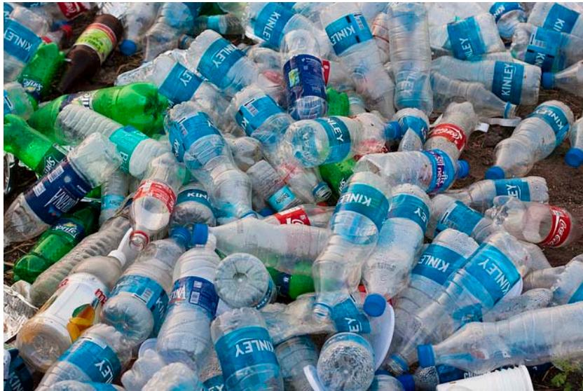
WASTE PET BOTTLES